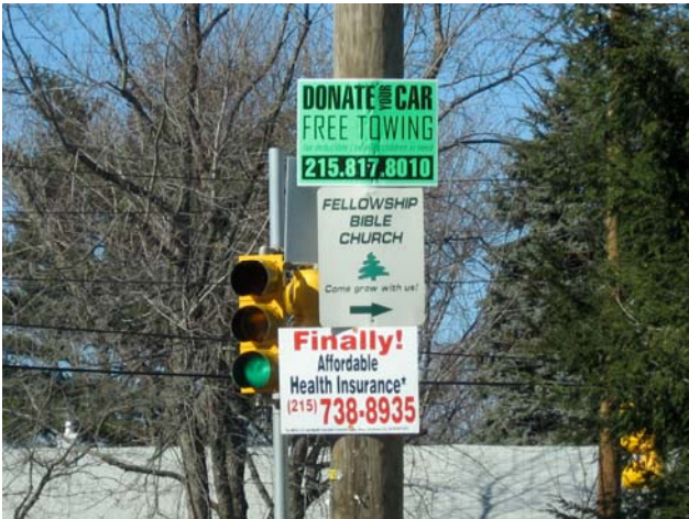
Evans & Byberry Rds 19116