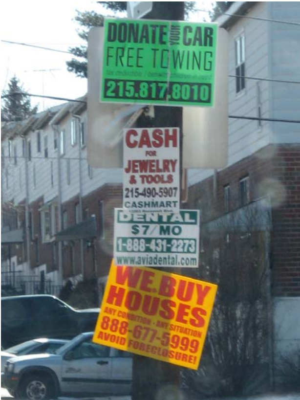
Woodhaven & Thorndale Rds 19154