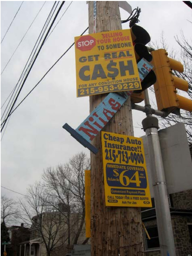
5900 Knox St 19144