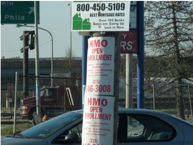
Front & Oregon 19148