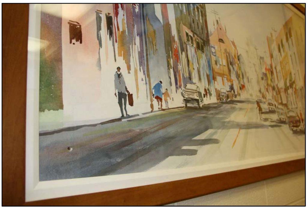
The painting hangs in the library's meeting room. Each corner has a puncture hole from screws that have been placed into the painting.

Location: Whitman Branch Library, 200 Snyder Avenue, Philadelphia, PA 19148