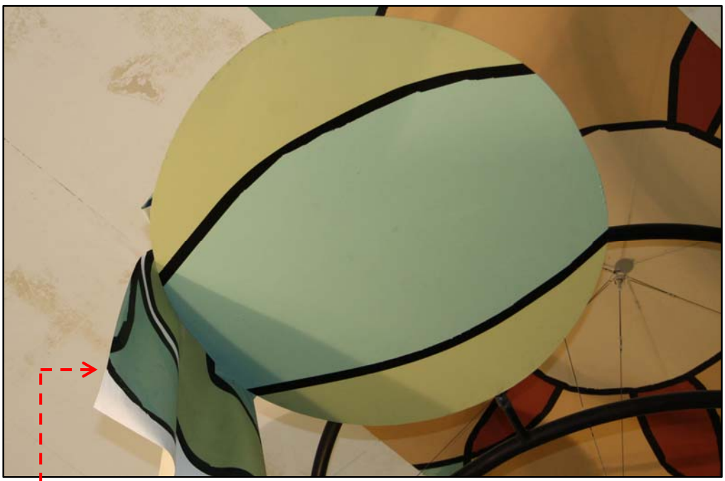
Here is a closer view of the mural's paper peeling off the ceiling and hanging on another object.

The mural hangs from the ceiling in the main entrance to the recreation center. Strips of paper have fallen off the ceiling and the pieces are hanging on other parts of the mural.