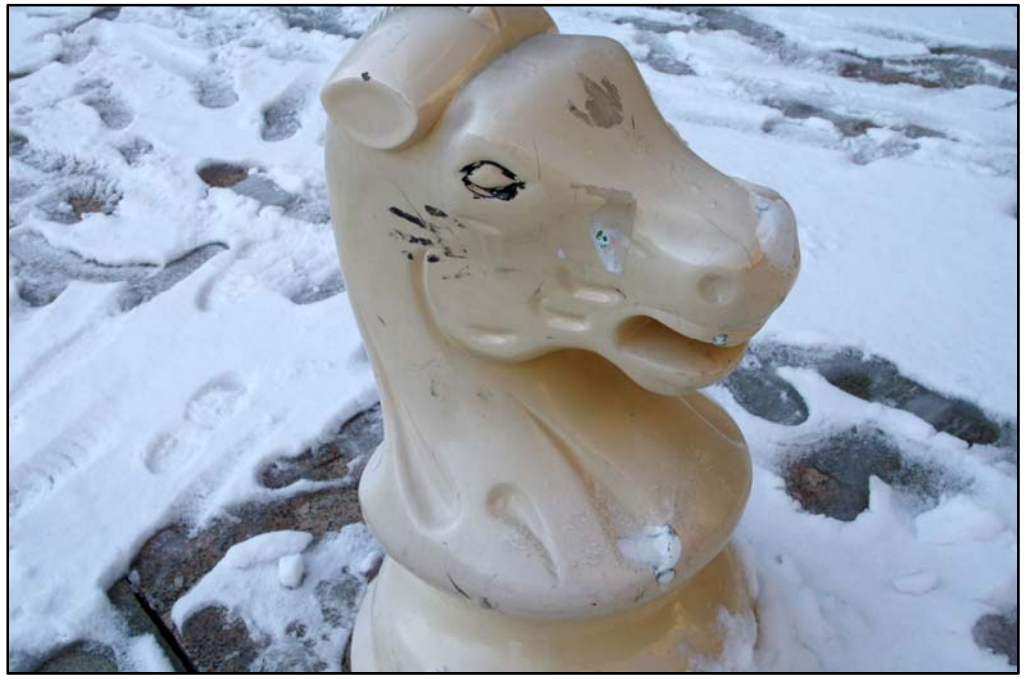
Here is a closer view of an over-sized chess piece that has been damaged.