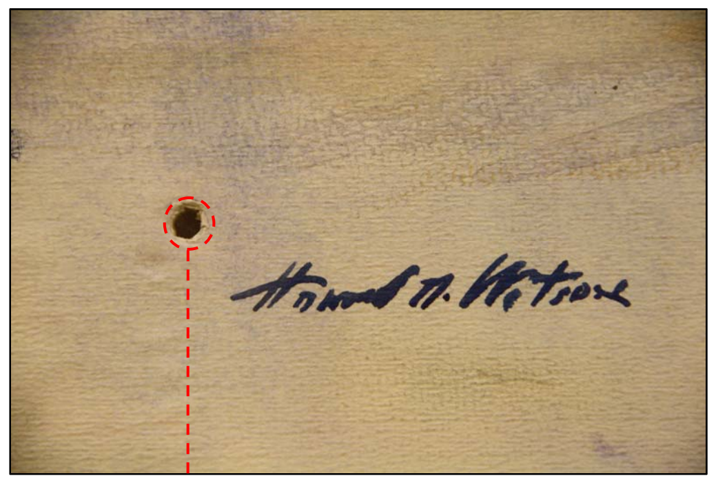
Here is a closer view of a puncture hole in the corner of the painting.