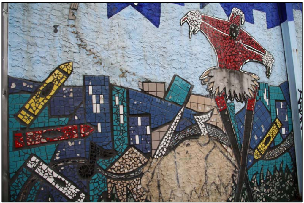
The mural hangs on the exterior wall of the creation center. Many colored tiles are damaged or removed from the mural, resulting in extensive damage.

Location: Hawthorne Recreation Center, 1200 Carpenter St., Philadelphia, PA 19147